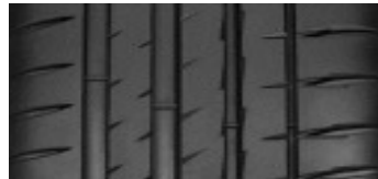
Summer Pilot Sport 4 245/45ZR19 (FW) 275/40ZR19 (RW)