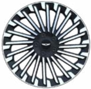
19" Alloy Hyper Silver A-Type Luxury