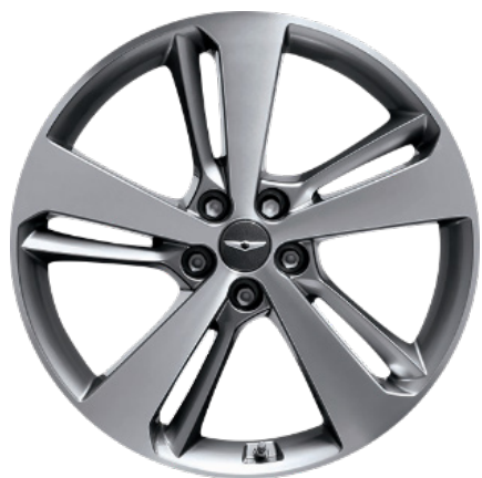
20" Alloy Medium Metallic Grey (Machine-finished) Premium Standard