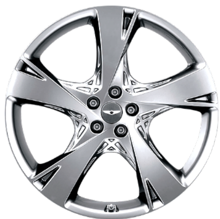
22" Alloy Medium Sputtering Premium Optional Luxury & Luxury Plus Standard