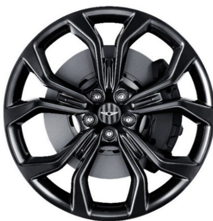
22" Alloy Black Sport Standard