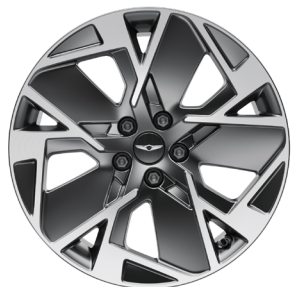
19" Alloy Front Machined Sport