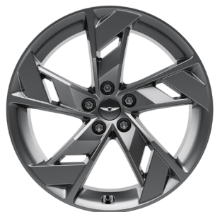
20" Alloy Dark Sputtering Sport